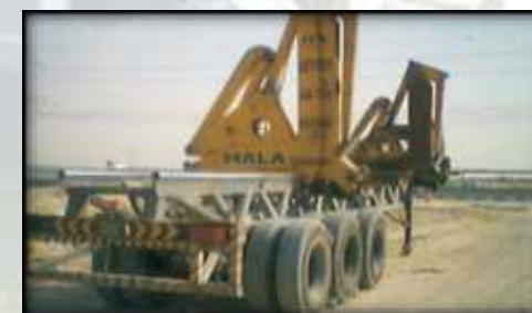
Proven design - oldest units are over 45 years old and still running