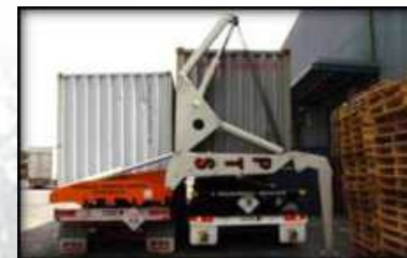
Fastest transfer. Empty trailer can move in or out beneath the suspended container