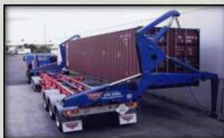
Lift or place containers anywhere even up against a wall or another container