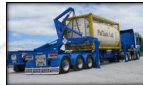
Support legs do not rest on adjacent trailer or truck chassis