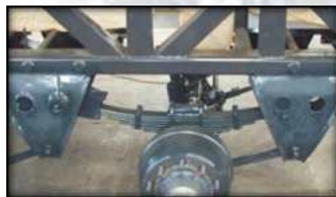
Fitted with locally backed running gear (reliability & spares availability)