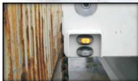
Infra red alignment system for easy alignment with containers