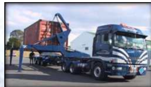
Most stable side lifter in the world. Lifting 35 or 40 ton containers