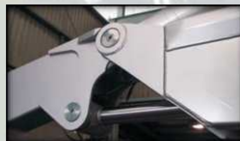
Hard chromed pins with expanding bushes for ultimate lifespan