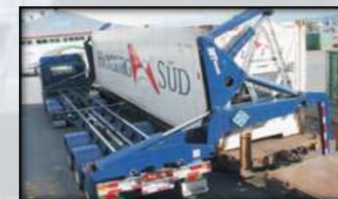
Load rail wagons without placing support foot onto it & no modifications needed.