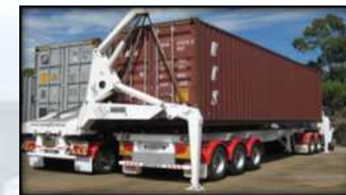
Load or unload other vehicles while the Swinglift itself is loaded.