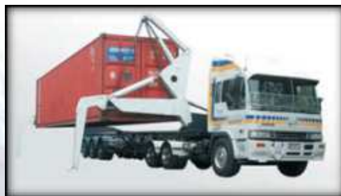
Low tare weight = Better payload