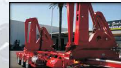
Reliable, maintenance friendly system. No computerized components (less unnecessary downtime)